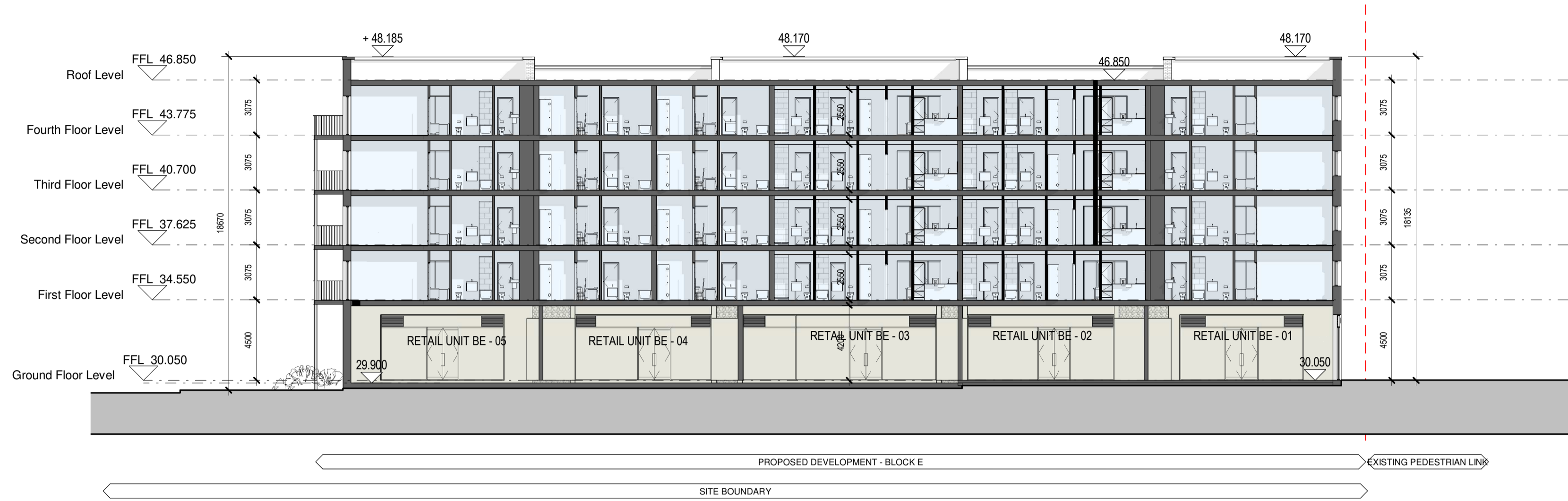
1 BLOCK E - SECTION AA 1 : 200